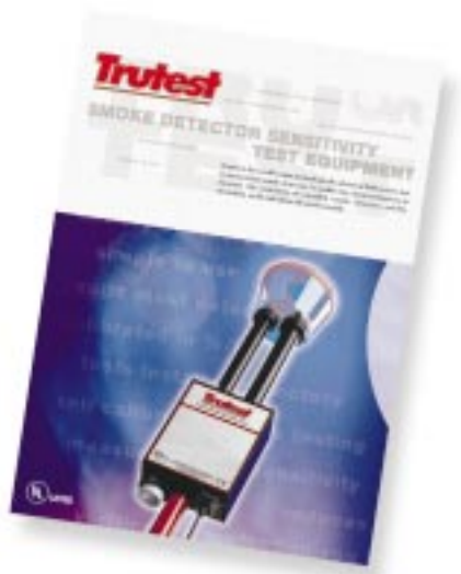
Trutest - Sensitivity Test Equipment