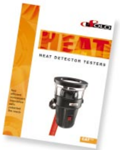
Heat Detector Testers